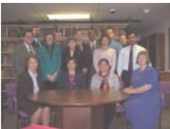
HAM–TMC Librarians and other Department Heads

A progress report will be made to the HAM-TMC Library Board in December 1999 and implementation of the new three-year plan can begin early in 2000.