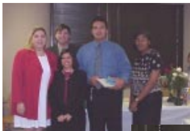
15 Years Service Awards