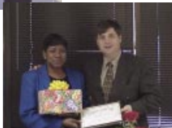
Employee of the Year