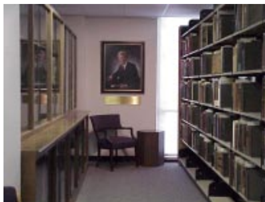
Remodeled McGovern Historical Collection