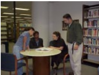
Consumer Health Information Service

In September, the KNS Division assumed responsibility for the Library's public relations efforts, including representation on the Texas Medical Center's Public Relations Committee, publication of Library Lines and the Library's Annual Report, and provision of information regarding Library activities to all Texas Medical Center newsletters.