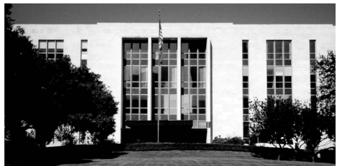
The Houston Academy of Medicine-Texas Medical Center Library is located on the first floor of the Jesse H. Jones Library Building in the heart of the Texas Medical Center at 1133 John Freeman Building.

The Circulation Desk issues library cards, checks out books, journals and audiovisu-