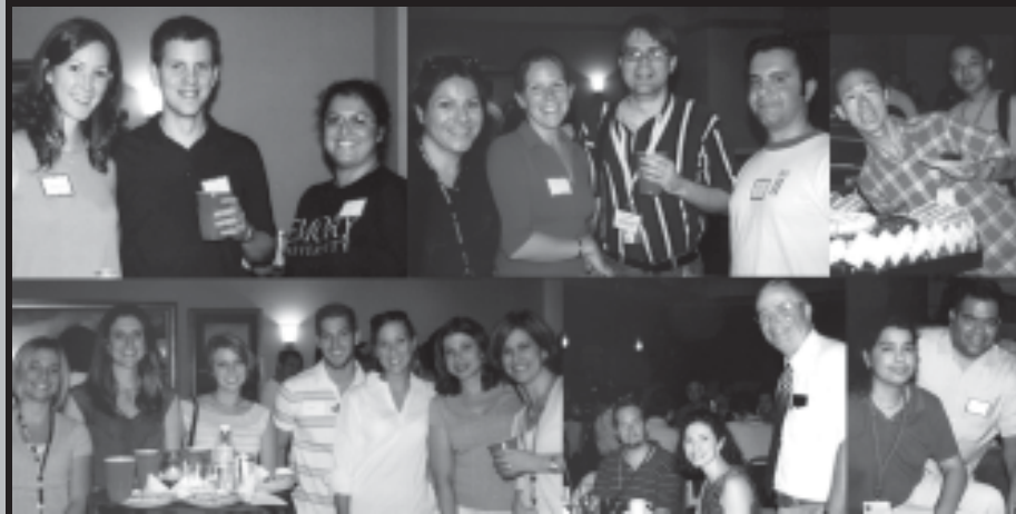
New and experienced graduate students wrap up orientation week with a reception and dinner