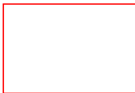
1998 Friends of the Library dinner: Rice Crystal Ballroom