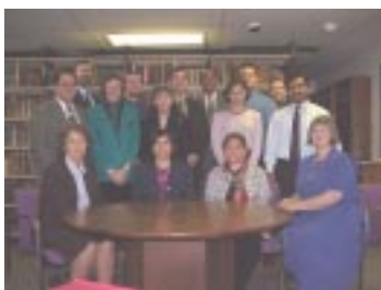
HAM–TMC Librarians and other Department Heads

A progress report will be made to the HAM-TMC Library Board in December 1999 and implementation of the new three-year plan can begin early in 2000.