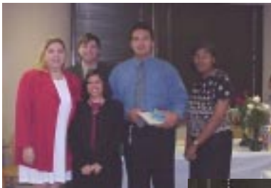
15 Years Service Awards