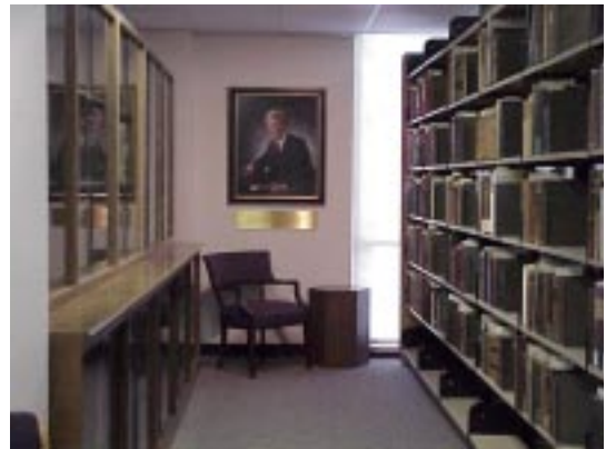
Remodeled McGovern Historical Collection