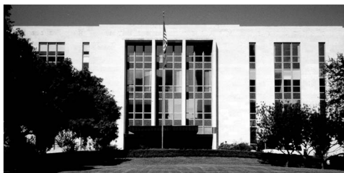
The Houston Academy of Medicine-Texas Medical Center Library is located on the first floor of the Jesse H. Jones Library Building in the heart of the Texas Medical Center at 1133 John Freeman Building.

issues library cards, checks out books, journals and audiovisu-