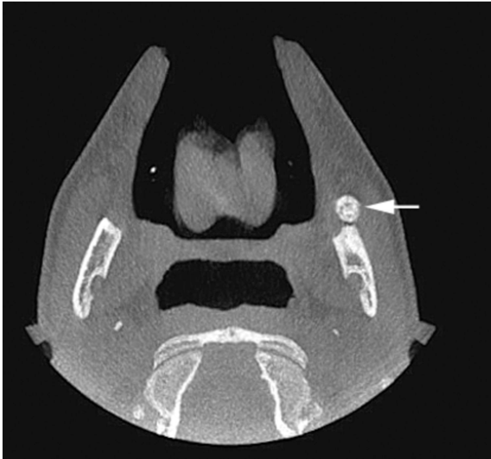
Figure 2. The axial view of the cone beam computer tomographic scan demonstrates a well defined radioopaque mass within the buccinator muscle anterior to the left mandibular ramus. This mass reveals zonation organization characterized by peripheral ossification and a focal central lucency.