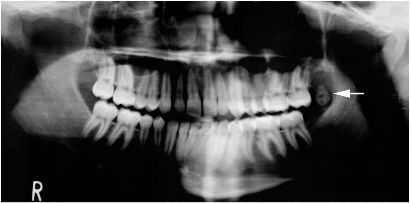
Figure 1. Panoramic radiograph taken at the time of initial presentation demonstrates a well defined ovoid calcified mass (arrow) just anterior to the anterior border of the left mandibular ramus. The mass reveals prominent peripheral maturation with a central area of radiolucency. Note that a radiolucent cleft separates this parosteal mass from the cortical margin of the anterior mandibular ramus.