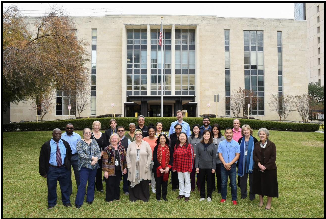
The TMC Library Staff