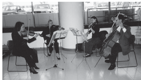
Doctor's Orchestra provided entertainment