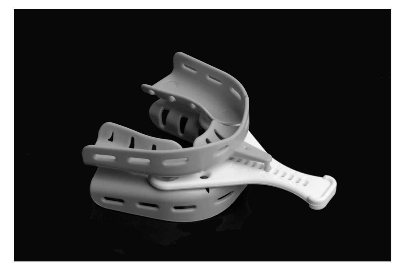
Fig. 1. Diagram of the intraoral device (EMA-T) used to advance the mandible

The appliance consists of plastic trays for the upper and lower dental arches. A custom-fitted appliance was constructed for each participant by placing fast-setting dental impression materials in the troughs of the trays. When the appliance was in place, the mandible was manually advanced by securing a peg in the projection from the upper tray into one of the holes in the projection from the lower tray.