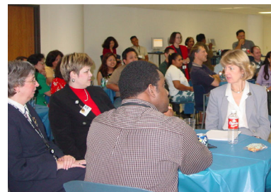
The employee awards ceremony was well attended