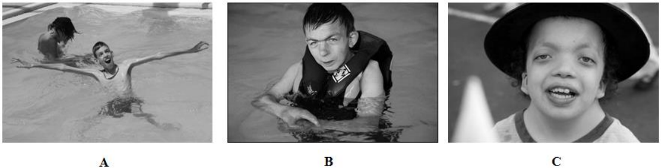
Figure 1: Natural Photographs Assessed in this Study

Eligible students received an email invitation (Appendix A) which included a link to the questionnaire (Appendix B). Participants were surveyed through REDCap, an anonymous online data collection system. Three genetic conditions, Marfan syndrome, Cornelia de Lange syndrome, and Noonan syndrome, were depicted in both the traditional and natural formats (Figure 1). The natural photographs used within this study were all Positive Exposure © images that were presented in black-and-white, similar to the traditional photos. Each photograph was followed by questions related to that photograph/condition.